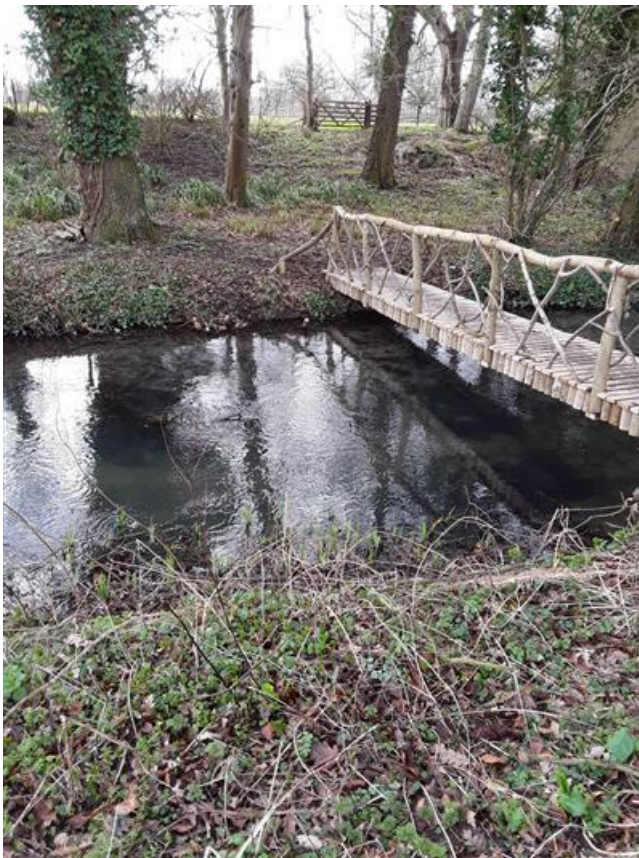
Figure 3. Lack of in-stream habitat and over wide and silty just us of Blackland Park. In need of brushwood berms and in-stream restoration.