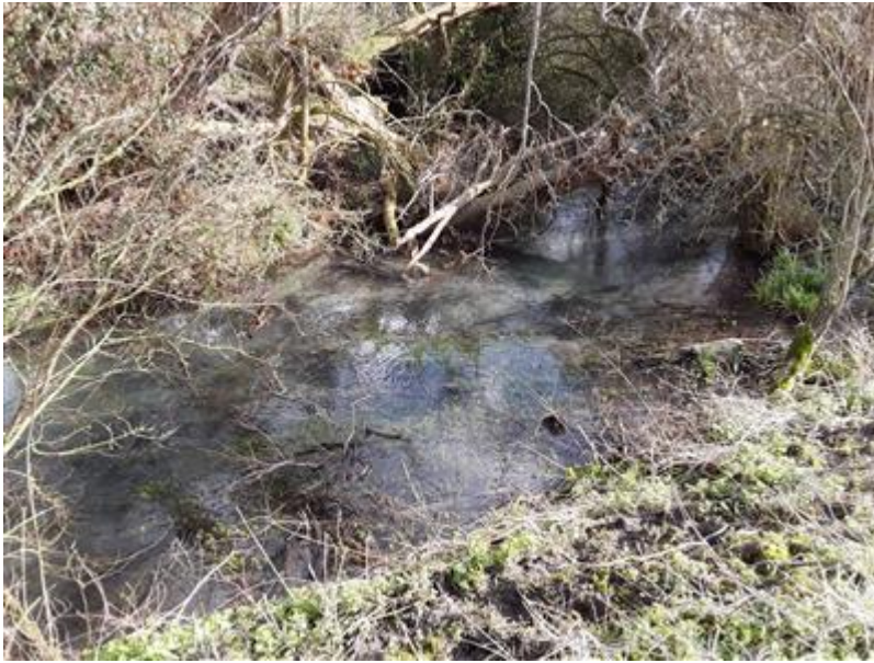
Figure 2. River Marden near Calstone – over wide, silty and needing riparian fencing and brushwood berms.