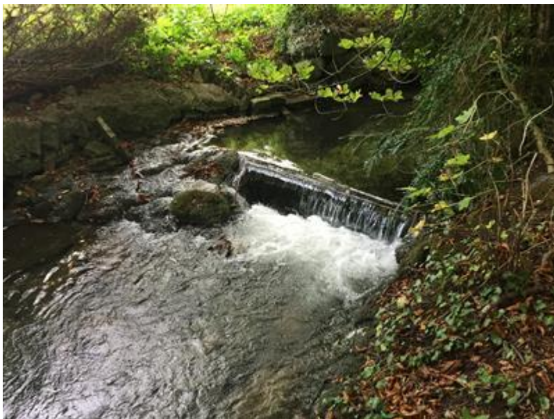
Figure 1. Weir removal/ notching opportunity on the River Marden between Blackland and A4

BART aims to use existing relationships with landowners and build on our relationship with the Bremhill Farm Cluster group in order to deliver the river restoration measures.