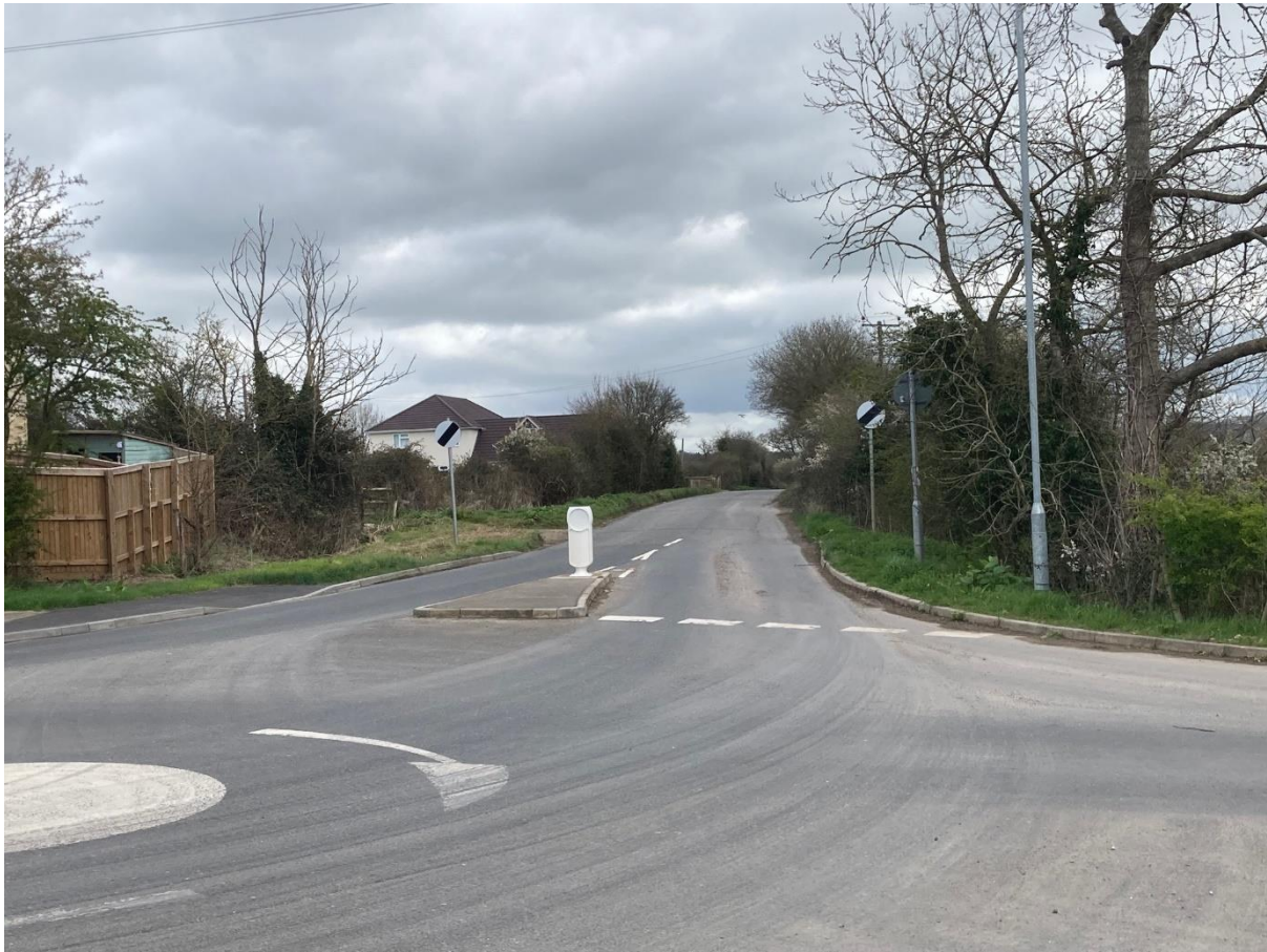
Figure 2 – view of Abberd Lane from 5 th April 2022

Following discussion with Wiltshire Council, the two National Speed Limit signs have been removed.