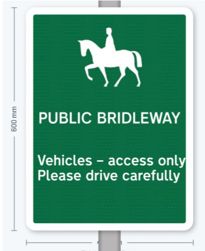
Figure 3 – proposed replacement signs.

It is proposed to replace the two National Speed Limit signs with two bespoke Public Bridleway signs as shown below: