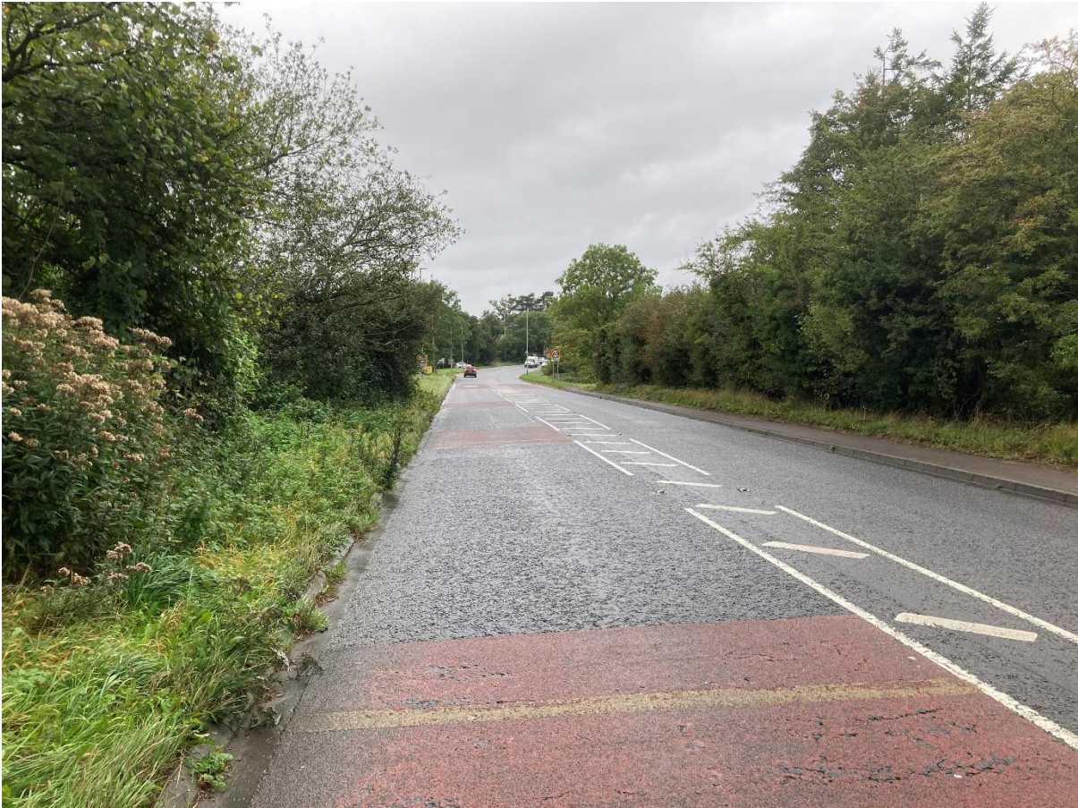
Figure 1 – view of junction from first set of surface treatment, approaching from the direction of Studley Crossroads

It is considered that this may be addressed by a combination of: