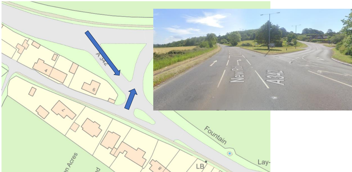
Figure 2: layout and view of right-hand filter heading up Old Derry Hill