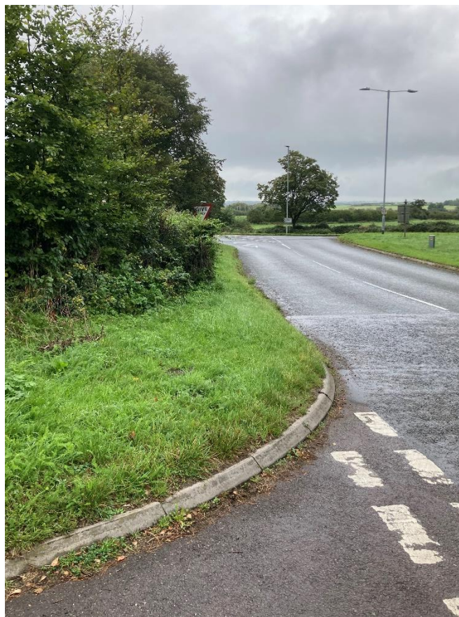
Figure 3: view towards the A4 from the "blind" exit from Old Derry Hill old road.

It is considered that this may be addressed by a combination of: